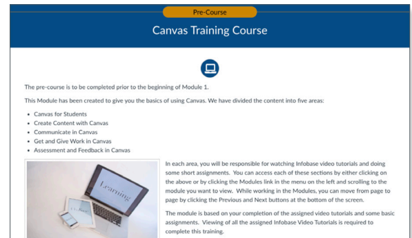
Screenshot of the PEOI Pre-Course on Canvas

While the focus of the PEOI precourse is Canvas, Premer and her team make a point to inform the students of the wealth of other training materials available in Infobase Learning Cloud, calling out the training courses on Adobe Creative Suite, Microsoft Office, and Google Applications specifically.