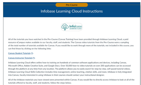
Screenshot of the PEOI Pre-Course Infobase Learning Cloud Instructions